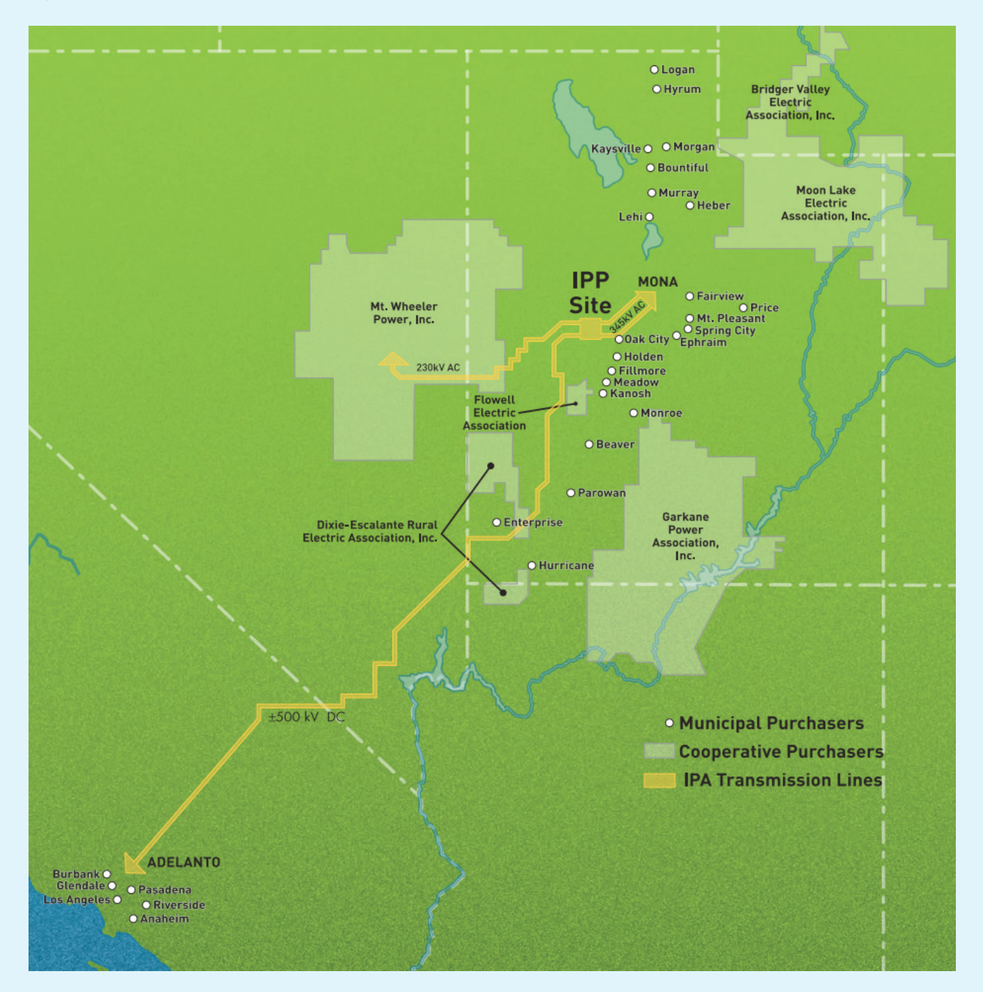
Figure 1: Map of IPA purchasers and transmission lines